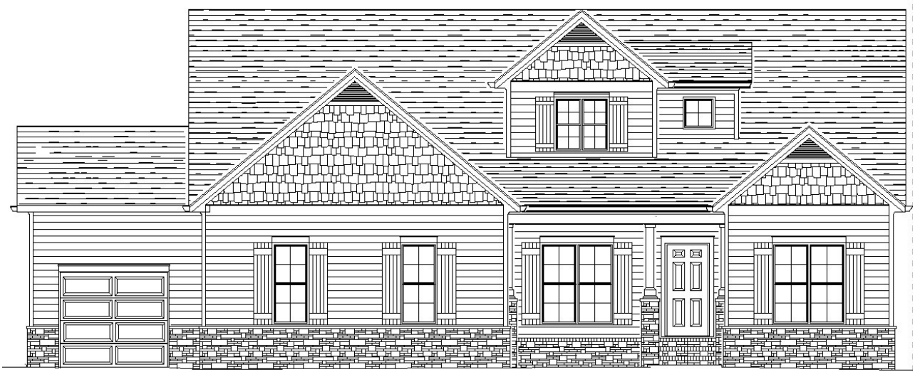
Front Elevation w/3rd Car Garage and Upstairs Options